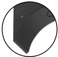
AXL-A-BR Die-cast Arm