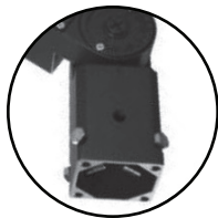
AXL-SF-BR Die-cast Slip-Fitter

Specifications are subject to change without notice. Installation must be performed in accordance with Barron Lighting Group installation instructions.