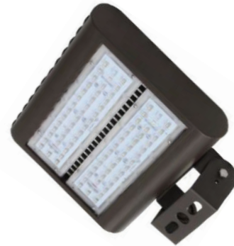
Standard Trunnion Mount